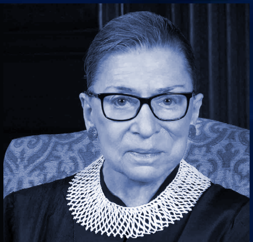
Ruth Bader Ginsburg